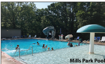
Mills Park Pool